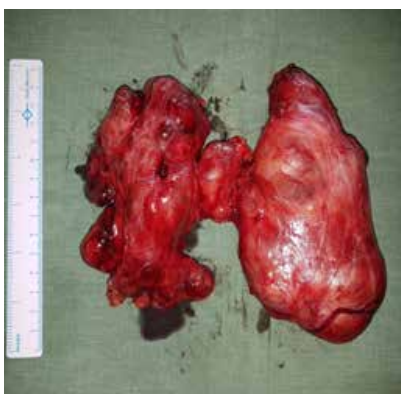
Fig IV: postoperative specimen after removal of thyroid mass.