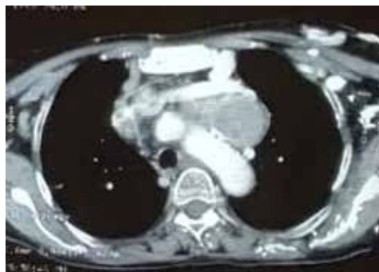
Fig III: CECT thorax showing retrosternal mass passing between the arch of aorta and brachiocephalic artery