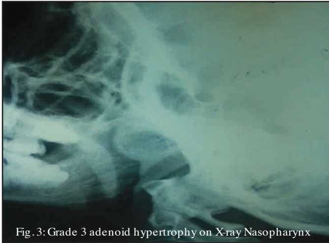
Fig. 3: Grade 3 adenoid hypertrophy on X-ray Nasopharynx

Nasal endoscopy was recorded using a DVD recorder. Afterward, only images of the adenoid were captured with a camera (Storz telecam). Pictures used for the calculation of the occupied parts were the pictures of the adenoid in which a full view of choana could be seen.